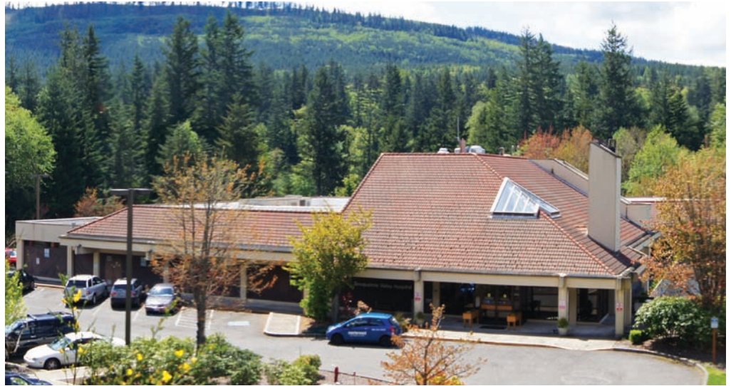
Snoqualmie Valley Hospital District serves the communities of North Bend, Snoqualmie, Fall City, Preston, Carnation and Snoqualmie Pass. Our regionally-acclaimed Swing Bed Program serves patients from all over King County. The hospital is located at 9575 Ethan Wade Way SE, Snoqualmie, about one mile from Mt. Si High School.

Critical Access Hospitals provide essential services to the communities they serve and are certified to receive cost-based reimbursement from Medicare. Snoqualmie Valley Hospital received CAH status in 2005.