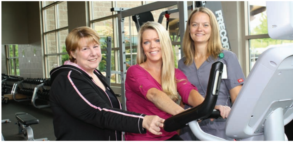
The YMCA and Snoqualmie Valley Hospital staff instruct Healthy Transitions participants how to safely use exercise equipment at the Snoqualmie Valley YMCA gym.