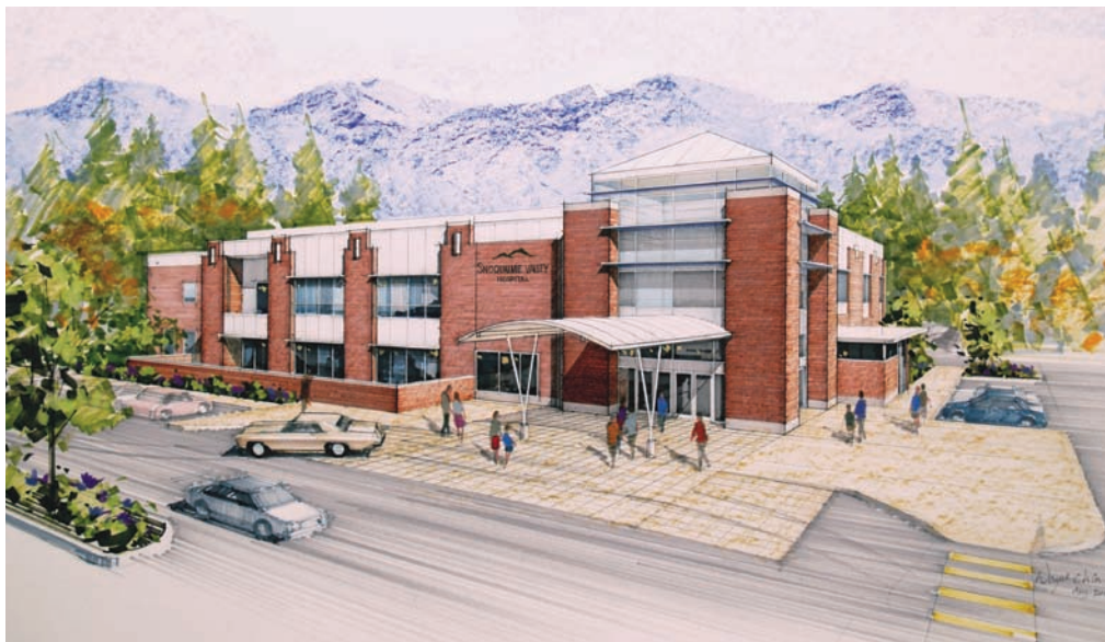
Rendering of the new hospital looking toward the main entry. The site is located within the City of Snoqualmie, close to the Snoqualmie Parkway exit from I-90. The facility is scheduled to open in late 2014.

"The goal is to get started on the exterior before the weather gets cold and wet," Jim Grafton, Capital Projects Manager for Snoqualmie