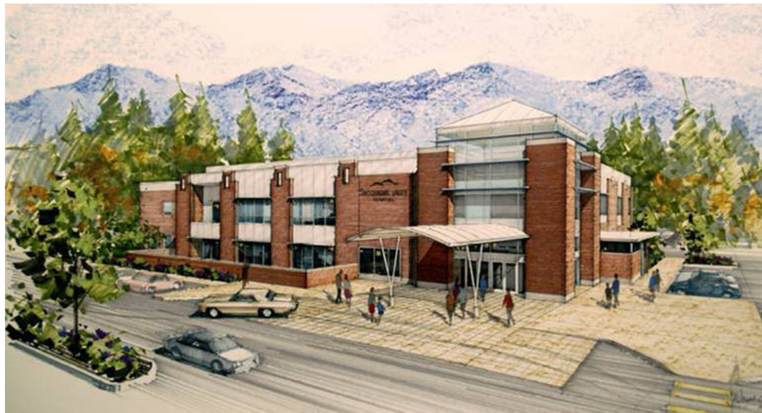
Sketch of the new hospital looking towards the northwest. The new, almost 9-acre site was purchased several years ago and grading work is almost complete. The site is located within the City of Snoqualmie, close to the Snoqualmie Parkway exit from I-90.